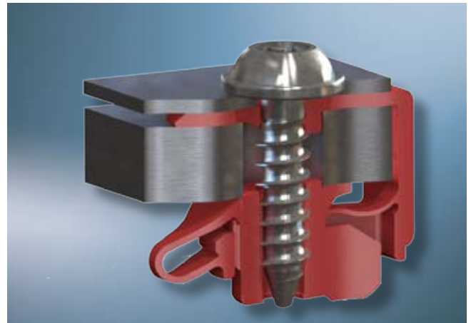
EASYboss® V functionality for various clamp thicknesses

With the EJOT EASYboss® V cost saving potentials can be realised through standardisation.